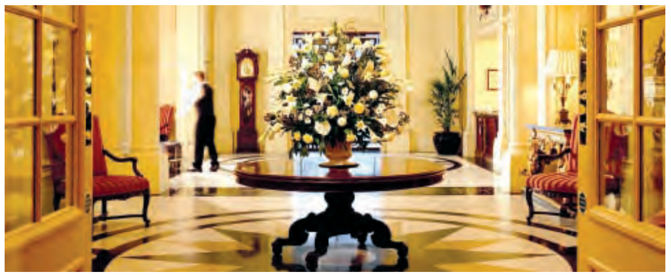
Imperial Hotel, Torquay.