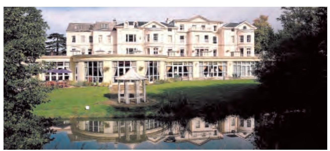
Cheltenham Park Hotel.

Turnover for 2008 of £28.5m comprises rent received from Barceló (2007: £77.0m being a combination of trading revenue from hotel operations and rent received from Barceló). Operating profit, before revaluation of properties, at £23.9m (2007: £11.1m) substantially increased, reflecting the benefit of the lease arrangements agreed with Barceló. This arises because PHP no longer bears the overhead of operating the hotel group. Moreover, PHP no longer needs to fund maintenance expenditure other than, as previously reported, that PHP has agreed, as part of the lease arrangements, to make a £10m contribution for capital works over the first 10 years of the lease. Of this, £2.9m has already been contributed in accordance with the agreement.